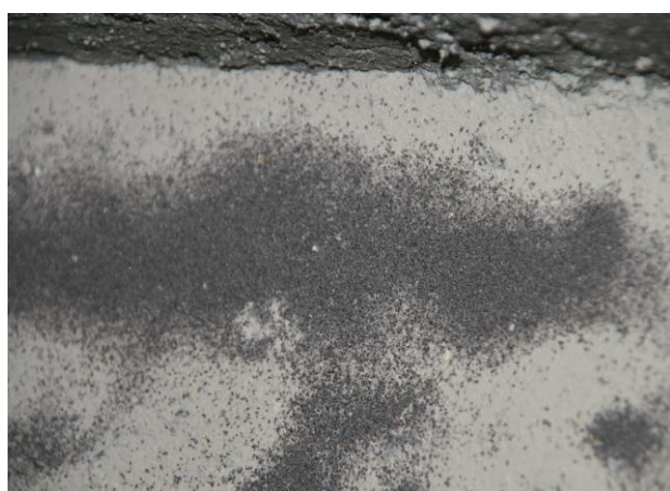
Fig 2. Detail from a cage without considerable effect of diatomaceous earth on D. gallinae .

Based on the results of biological efficacy, we have conducted a selection of formulations for clinical examination. We have singled out characteristic examples