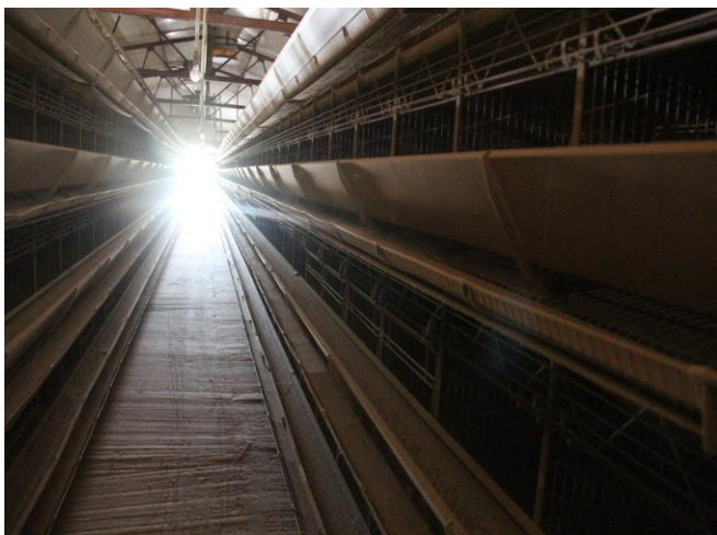
Fig. 5. An example of a prepared facility by combined method, application of the powder and liquid forms of the SiO 2 formulations.