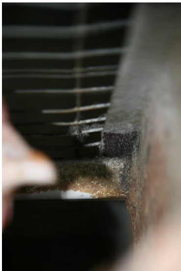
Fig.3. Behavioral adaptation of D. gallinae to the application of SiO 2 formulations.